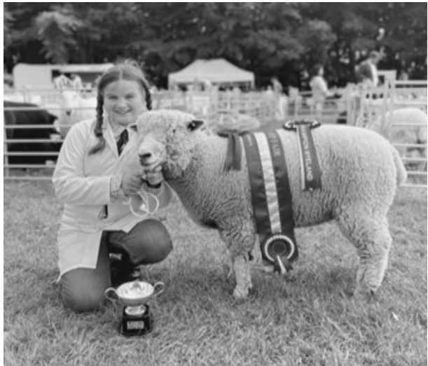
This me with Cottage Bambi winning Ryeland champion at Findon sheep fair 2022

In August 2019 when I was 9 years old my dad got a new job as a farm manager, when I found out we would be moving house to a farm I was lucky enough to start thinking about getting sheep which was my dream. When I asked my parents, my mum said yes however my dad